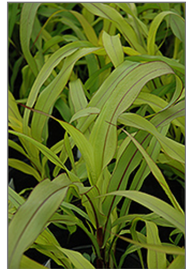
Jester Millet foliage