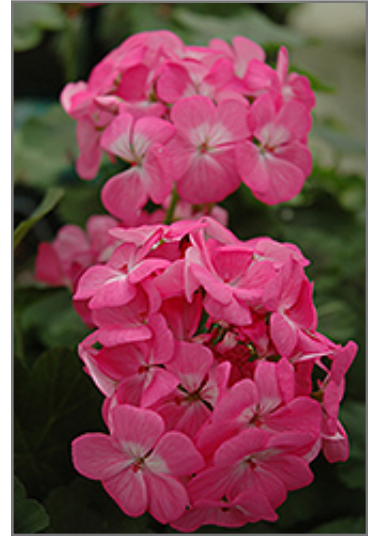
Pillar Pink Geranium flowers