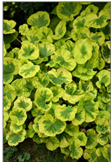
Crystal Palace Gem Geranium foliage