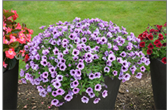
Supertunia Bordeaux Petunia in bloom

Supertunia Bordeaux Petunia is a fine choice for the garden, but it is also a good selection for planting in outdoor containers and hanging baskets. Because of its trailing habit of growth, it is ideally suited for use as a 'spiller' in the 'spiller-thriller-filler' container combination; plant it near the edges where it can spill gracefully over the pot. Note that when growing plants in outdoor containers and baskets, they may require more frequent waterings than they would in the yard or garden.