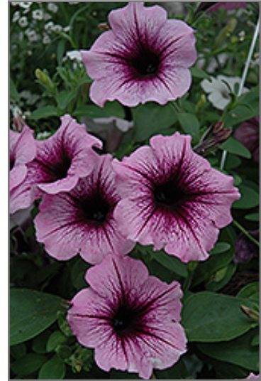
Supertunia Bordeaux Petunia flowers