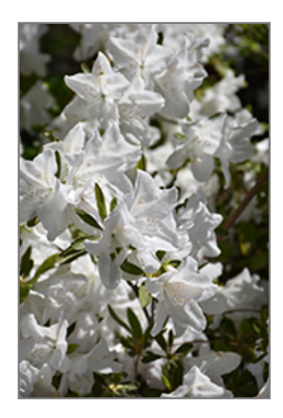
Weston's Innocence Rhododendron flowers

Weston's Innocence Rhododendron will grow to be about 4 feet tall at maturity, with a spread of 4 feet. It tends to be a little leggy, with a typical clearance of 1 foot from the ground. It grows at a slow rate, and under ideal conditions can be expected to live for 40 years or more.