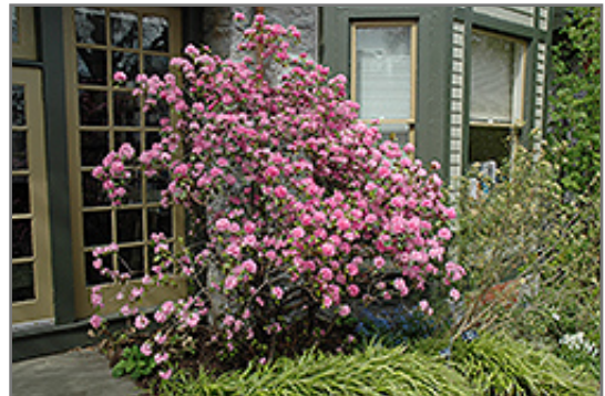
Olga Mezitt Rhododendron in bloom