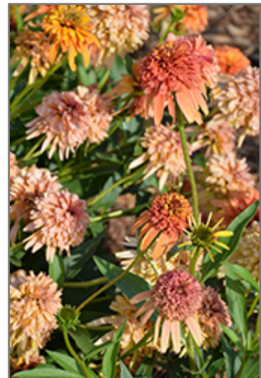
Cone-fections Marmalade Coneflower flowers