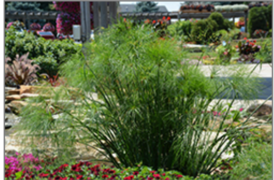
King Tut Egyptian Papyrus