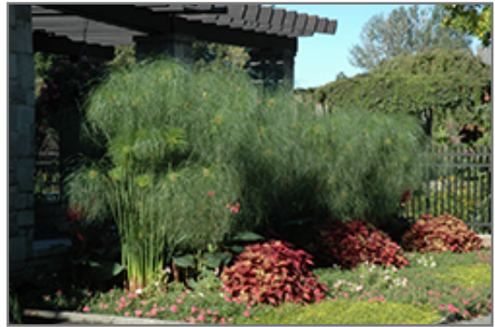
King Tut Egyptian Papyrus