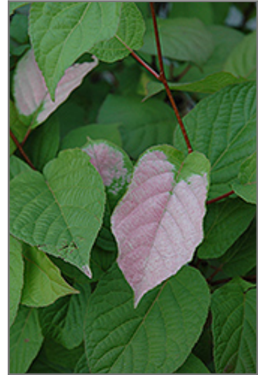
September Sun Kiwi foliage