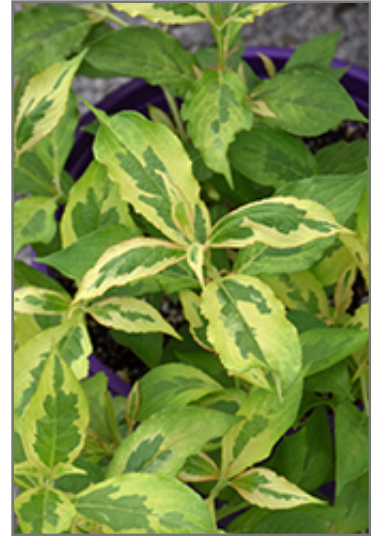
My Monet Sunset Weigela foliage