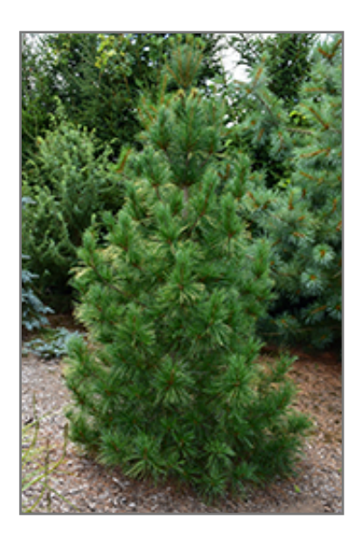
Columnar White Pine

Columnar White Pine will grow to be about 40 feet tall at maturity, with a spread of 15 feet. It has a low canopy with a typical clearance of 3 feet from the ground, and is suitable for planting under power lines. It grows at a fast rate, and under ideal conditions can be expected to live to a ripe old age of 100 years or more; think of this as a heritage tree for future generations!