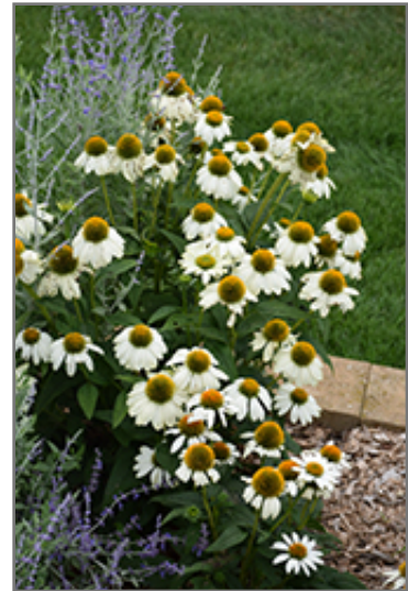
PowWow White Coneflower in bloom