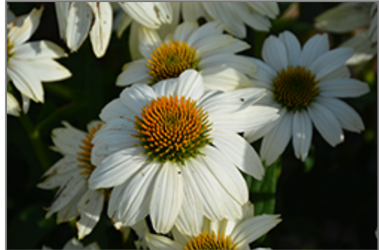
PowWow White Coneflower flowers

PowWow White Coneflower is recommended for the following landscape applications;