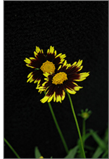
Cosmic Eye Tickseed flowers