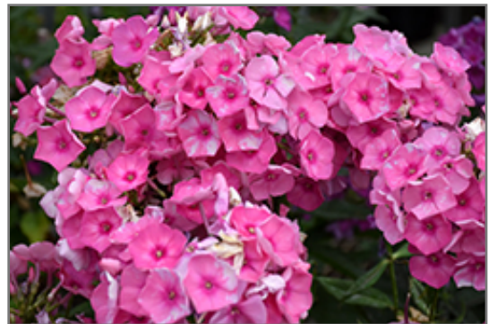
Bubble Gum Pink Garden Phlox flowers