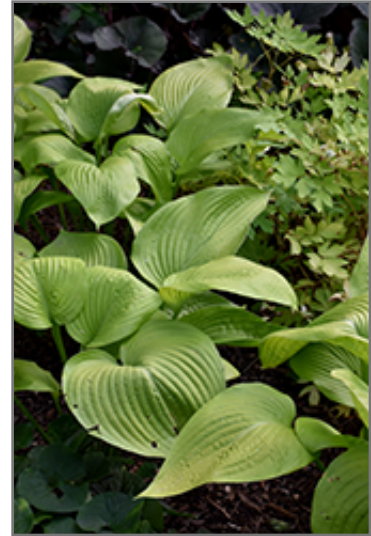
Key West Hosta

This plant does best in partial shade to shade. It prefers to grow in average to moist conditions, and shouldn't be allowed to dry out. It is not particular as to soil type or pH. It is somewhat tolerant of urban pollution. This particular variety is an interspecific hybrid. It can be propagated by division; however, as a cultivated variety, be aware that it may be subject to certain restrictions or prohibitions on propagation.