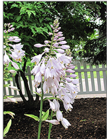
Key West Hosta flowers