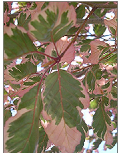
Tricolor Beech foliage