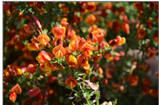
Lena Scotch Broom flowers