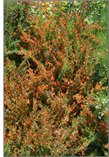
Lena Scotch Broom in bloom

This shrub should only be grown in full sunlight. It prefers dry to average moisture levels with very well-drained soil, and will often die in standing water. It is considered to be drought-tolerant, and thus makes an ideal choice for xeriscaping or the moisture-conserving landscape. It is particular about its soil conditions, with a strong preference for clay, alkaline soils, and is able to handle environmental salt. It is highly tolerant of urban pollution and will even thrive in inner city environments. This particular variety is an interspecific hybrid.