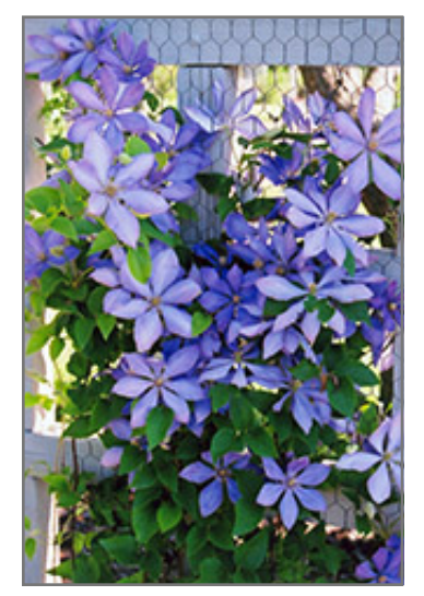
Mrs. Cholmondeley Clematis flowers

Mrs. Cholmondeley Clematis is a multi-stemmed deciduous woody vine with a twining and trailing habit of growth. Its average texture blends into the landscape, but can be balanced by one or two finer or coarser trees or shrubs for an effective composition.