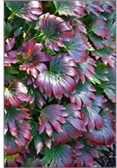
Crimson Fans Mukdenia foliage

Crimson Fans Mukdenia is recommended for the following landscape applications;