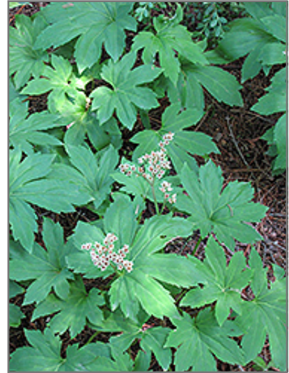
Crimson Fans Mukdenia flowers

Crimson Fans Mukdenia is a fine choice for the garden, but it is also a good selection for planting in outdoor pots and containers. It is often used as a 'filler' in the 'spiller-thriller-filler' container combination, providing a mass of flowers and foliage against which the larger thriller plants stand out. Note that when growing plants in outdoor containers and baskets, they may require more frequent waterings than they would in the yard or garden.