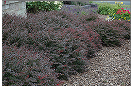
Crimson Pygmy Japanese Barberry