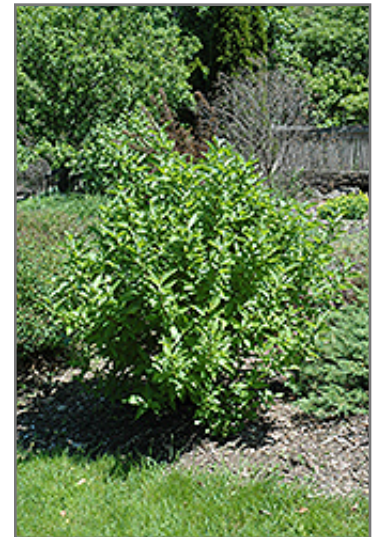
Arctic Fire Red Twig Dogwood