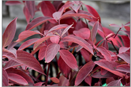
Arctic Fire Red Twig Dogwood in fall

This shrub does best in full sun to partial shade. It is an amazingly adaptable plant, tolerating both dry conditions and even some standing water. It is not particular as to soil type or pH. It is highly tolerant of urban pollution and will even thrive in inner city environments. This is a selection of a native North American species.