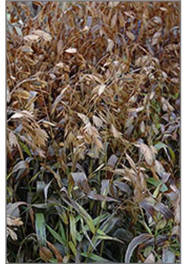
Northern Sea Oats in fall

Northern Sea Oats is recommended for the following landscape applications;