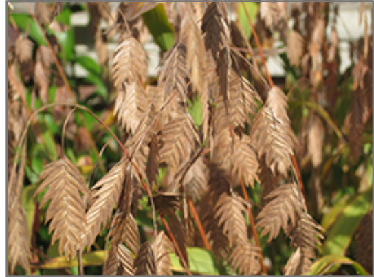
Northern Sea Oats fruit

Northern Sea Oats will grow to be about 4 feet tall at maturity, with a spread of 30 inches. Its foliage tends to remain dense right to the ground, not requiring facer plants in front. It grows at a medium rate, and under ideal conditions can be expected to live for approximately 10 years. As an herbaceous perennial, this plant will usually die back to the crown each winter, and will regrow from the base each spring. Be careful not to disturb the crown in late winter when it may not be readily seen!