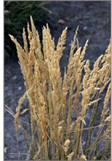
El Dorado Feather Reed Grass fruit

El Dorado Feather Reed Grass is a fine choice for the garden, but it is also a good selection for planting in outdoor pots and containers. Because of its height, it is often used as a 'thriller' in the 'spiller-thriller-filler' container combination; plant it near the center of the pot, surrounded by smaller plants and those that spill over the edges. It is even sizeable enough that it can be grown alone in a suitable container. Note that when growing plants in outdoor containers and baskets, they may require more frequent waterings than they would in the yard or garden.