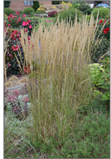
El Dorado Feather Reed Grass