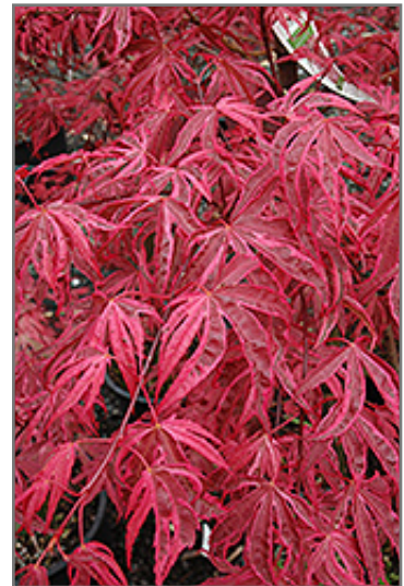
Shirazz Japanese Maple foliage