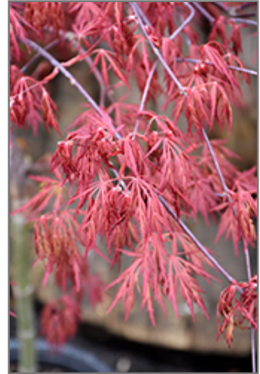
Orangeola Cutleaf Japanese Maple foliage

Orangeola Cutleaf Japanese Maple is a fine choice for the yard, but it is also a good selection for planting in outdoor pots and containers. Because of its height, it is often used as a 'thriller' in the 'spiller-thriller-filler' container combination; plant it near the center of the pot, surrounded by smaller plants and those that spill over the edges. It is even sizeable enough that it can be grown alone in a suitable container. Note that when grown in a container, it may not perform exactly as indicated on the tag - this is to be expected. Also note that when growing plants in outdoor containers and baskets, they may require more frequent waterings than they would in the yard or garden.