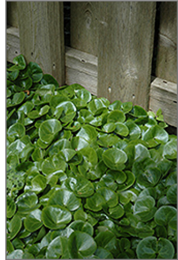
European Wild Ginger