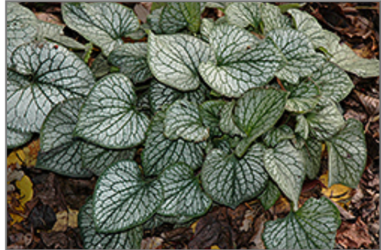
Jack Frost Bugloss