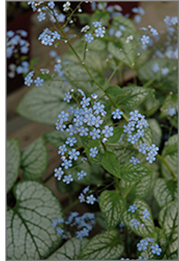
Jack Frost Bugloss flowers

Jack Frost Bugloss is a fine choice for the garden, but it is also a good selection for planting in outdoor pots and containers. It is often used as a 'filler' in the 'spiller-thriller-filler' container combination, providing a mass of flowers and foliage against which the thriller plants stand out. Note that when growing plants in outdoor containers and baskets, they may require more frequent waterings than they would in the yard or garden.