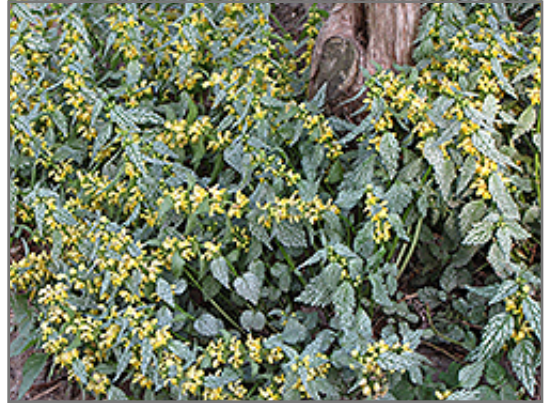
Hermann's Pride Yellow Archangel in bloom

This plant does best in partial shade to shade. It is an amazingly adaptable plant, tolerating both dry conditions and even some standing water. It is considered to be drought-tolerant, and thus makes an ideal choice for a low-water garden or xeriscape application. It is not particular as to soil type or pH. It is highly tolerant of urban pollution and will even thrive in inner city environments. This is a selected variety of a species not originally from North America. It can be propagated by division; however, as a cultivated variety, be aware that it may be subject to certain restrictions or prohibitions on propagation.