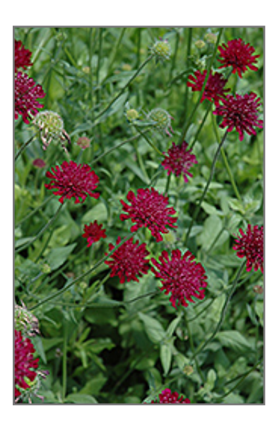
Crimson Scabious flowers

This plant does best in full sun to partial shade. It prefers to grow in average to dry locations, and dislikes excessive moisture. It is considered to be drought-tolerant, and thus makes an ideal choice for a low-water garden or xeriscape application. It is not particular as to soil type, but has a definite preference for alkaline soils. It is somewhat tolerant of urban pollution. This species is not originally from North America.