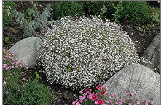
Creeping Baby's Breath in bloom