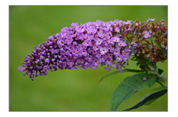
Pugster Periwinkle Butterfly Bush flowers