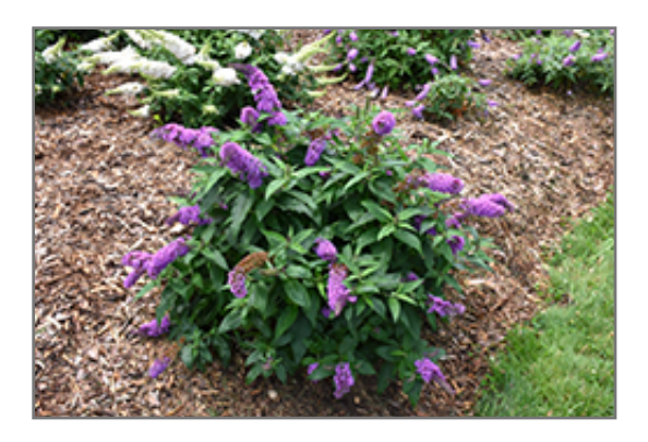
Pugster Periwinkle Butterfly Bush in bloom