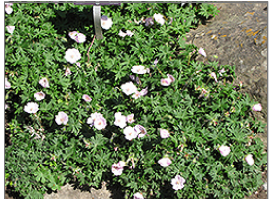
Striated Cranesbill in bloom