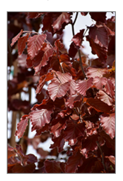
Red Obelisk Beech foliage