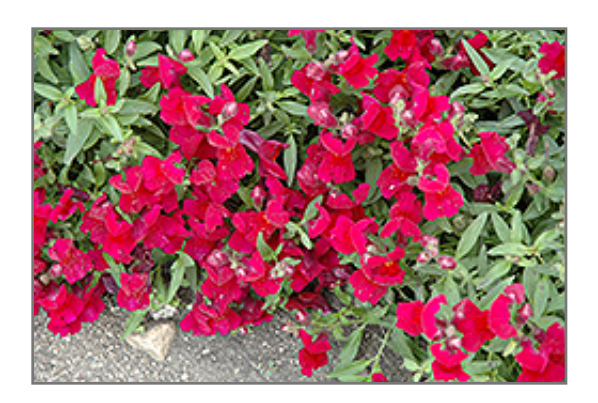
Candy Showers Deep Purple Snapdragon flowers

Candy Showers Deep Purple Snapdragon is clothed in stunning lightly-scented violet pea-like flowers with pink overtones at the ends of the stems from mid spring to mid fall. Its small pointy leaves remain green in color throughout the season.