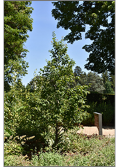
Firespire American Hornbeam

This tree performs well in both full sun and full shade. It is an amazingly adaptable plant, tolerating both dry conditions and even some standing water. It is not particular as to soil type or pH. It is somewhat tolerant of urban pollution. This is a selection of a native North American species.