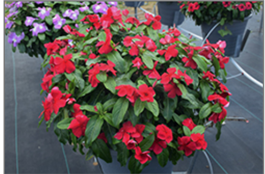
Titan Dark Red Vinca in bloom

Titan Dark Red Vinca will grow to be about 14 inches tall at maturity, with a spread of 12 inches. Its foliage tends to remain dense right to the ground, not requiring facer plants in front. Although it's not a true annual, this fast-growing plant can be expected to behave as an annual in our climate if left outdoors over the winter, usually needing replacement the following year. As such, gardeners should take into consideration that it will perform differently than it would in its native habitat.