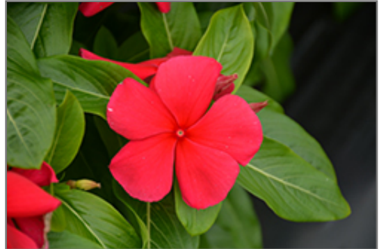
Titan Dark Red Vinca flowers

Titan Dark Red Vinca is recommended for the following landscape applications;