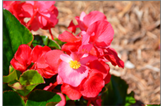
Whopper Rose Green Leaf Begonia flowers