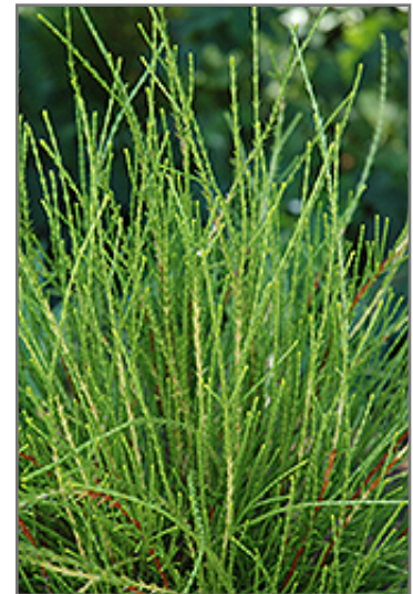
Franky Boy Arborvitae foliage