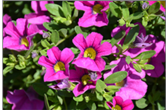
Million Bells Trailing Pink Calibrachoa flowers