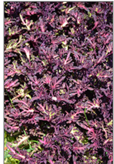
Merlin's Magic Coleus foliage