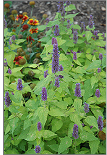
Golden Jubilee Anise Hyssop flowers

Golden Jubilee Anise Hyssop is recommended for the following landscape applications;